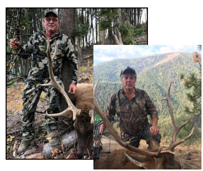
Archery Style Clothing