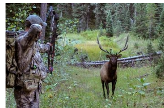
Shots like this are Rare Are You Ready?

That might be what it takes to bring that bull down. Often times the perfect shot just doesn't happen, so you need to be prepared to take the best shot possible in any given situation. Brush, Trees, Flies, Bees, Sweat Drops, Sun Spots and more can influence your shot.