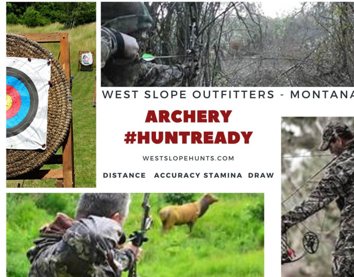
WEST SLOPE OUTFITTERS - MONTANA

Remember Elk can see an ant move a mile away...well maybe not that far, but the point is you have to be able to go from Zero to Let Her Fly!! in a split second, with such precision, that the elk never sees you move.