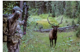
Shots like this are Rare Are You Ready?

That might be what it takes to bring that bull down. Often times the perfect shot just doesn't happen, so you need to be prepared to take the best shot possible in any given situation. Brush, Trees, Flies, Bees, Sweat Drops, Sun Spots and more can influence your shot.